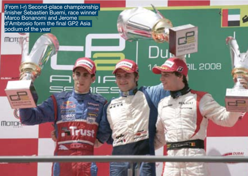
(From l-r) Second-place championship finisher Sebastien Buemi, race winner Marco Bonanomi and Jerome d'Ambrosio form the final GP2 Asia podium of the year